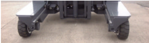
Forward / Reverse Mode