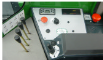
The operator compartment on the C8000 Electric

The C8000E has a single rear wheel providing excellent manoeuvrability.