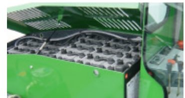
The battery compartment on the C8000 Electric