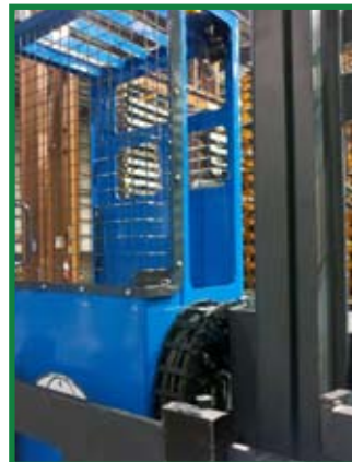
MESH FRONT & REAR