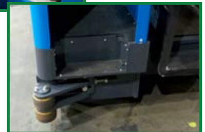
ADJUSTABLE DOUBLE GUIDE ROLLERS