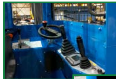
SPACIOUS ERGONOMIC CABIN