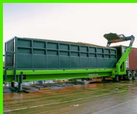
Logs are preloaded into the Tub & Container attached