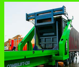
Hatch Locks Down & Tub Powers Out