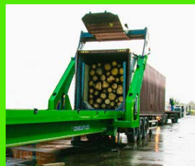
Hatch Closes Down