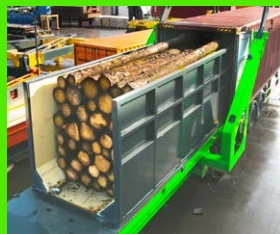
Loaded Tub securely inside Container.