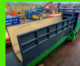
Hatch Opens Up & loaded Container is Detached.