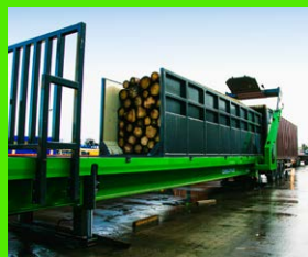
Loaded Tub is powered into the Container